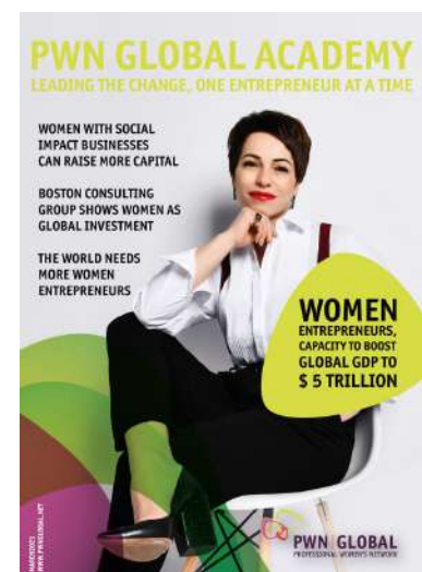
This could be the cover of your club magazine, created and promoted by EuropeanLife.