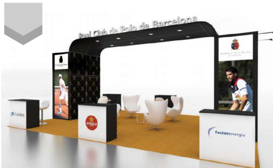
This is an example of a Stand Island; Possible for your club and members in our Luxury Tradeshow.